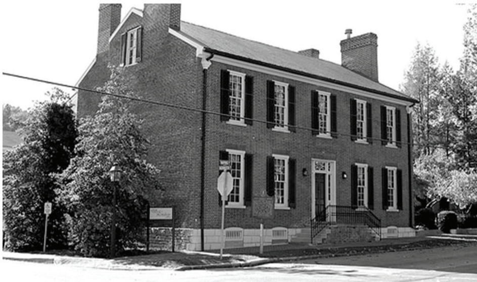
Vest's childhood home in Frankfort, Kentucky, known today as the Vest-Lindsey House.